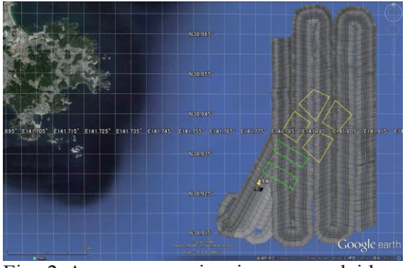
Fig. 2 A sonar mapping image overlaid on Google-Earth map.