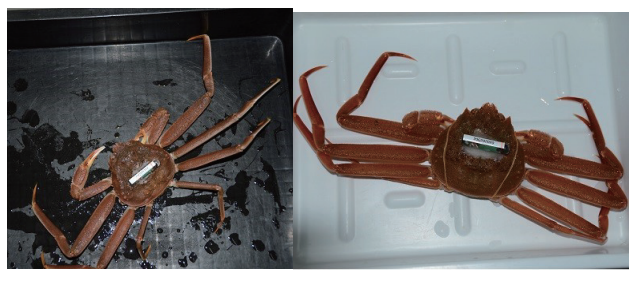
(a) (b) Figs. 1 Pictures of pinger attached on snow crab.

In these two figs., we set the detection threshold as around 200, and can detect the signal at greater than -5 dB for the SNR. Fig. 2 (c) shows relationship between the SNR and range. Two cases, noise level is 50 and 60 dB \mu Pa/ \sqrt{Hz} , were considered. In this scope, detectable range can be assumed as about 300 - 600 meters.